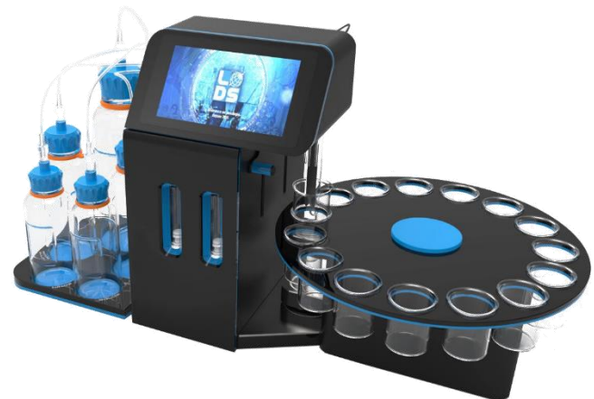
Total acidity – Volatile acidity after extraction - Free SO 2 – Total SO 2

This device allows to determine pH, total acidity directly in the sample, and volatile acidity after extraction, without any need to see a color change at the end of titration. This enables optimum accuracy and reproducibility of the results. Supplied with titration glassware and the chemicals needed for over a hundred analyzes.